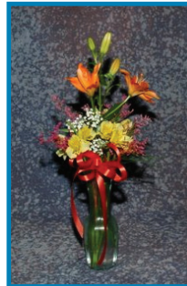
1-C Lily Basket/Vase