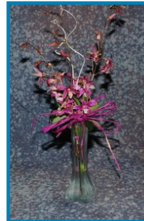
1-D Sm Orchid