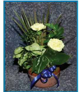
1-E Dish Garden