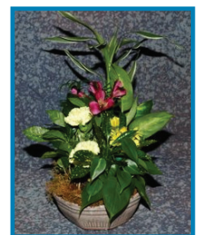
3-D Dish Garden