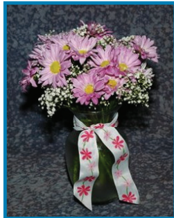
1-B Crazy Daisies