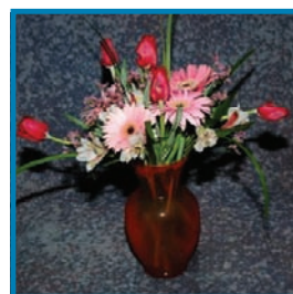
4-A Delux Spring - $50.00