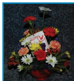
3-B Chicken Soup - $40.00

Central & 4th Street North 727.823.1414 www.greenbench.com