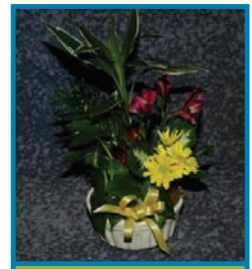
2-D Dish Garden