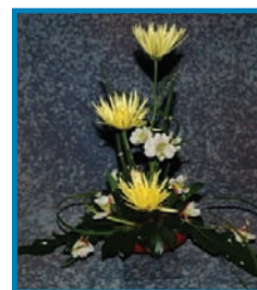
3-C Say with Style