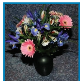
4-B Delux Cheery - $50.00