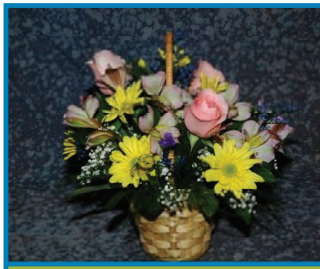
2-A Spring in a Basket